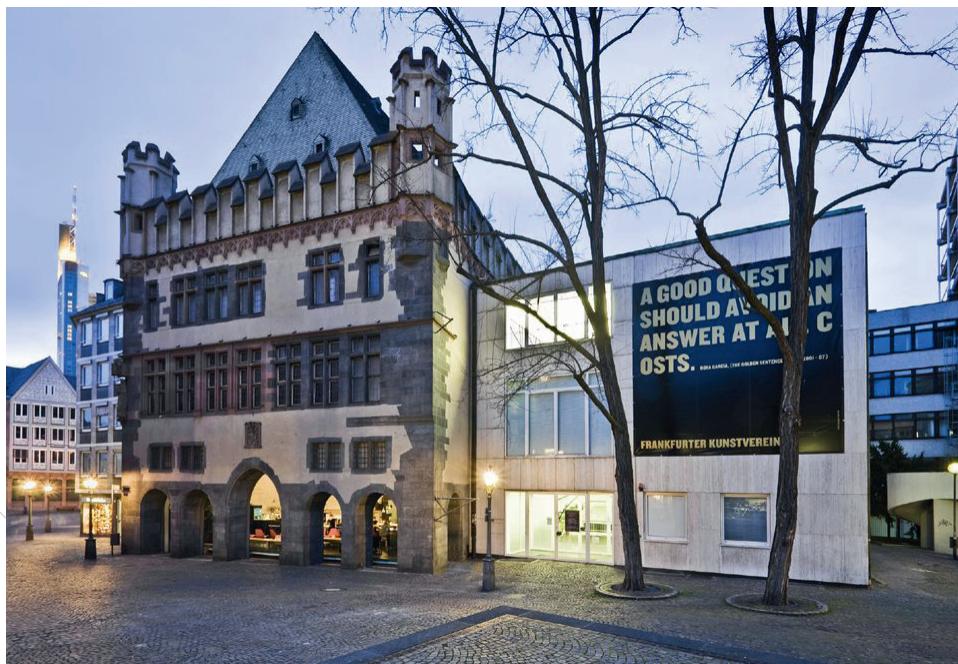
Venue of NODE13: We are very happy to cooperate again with the Frankfurter Kunstverein as host.