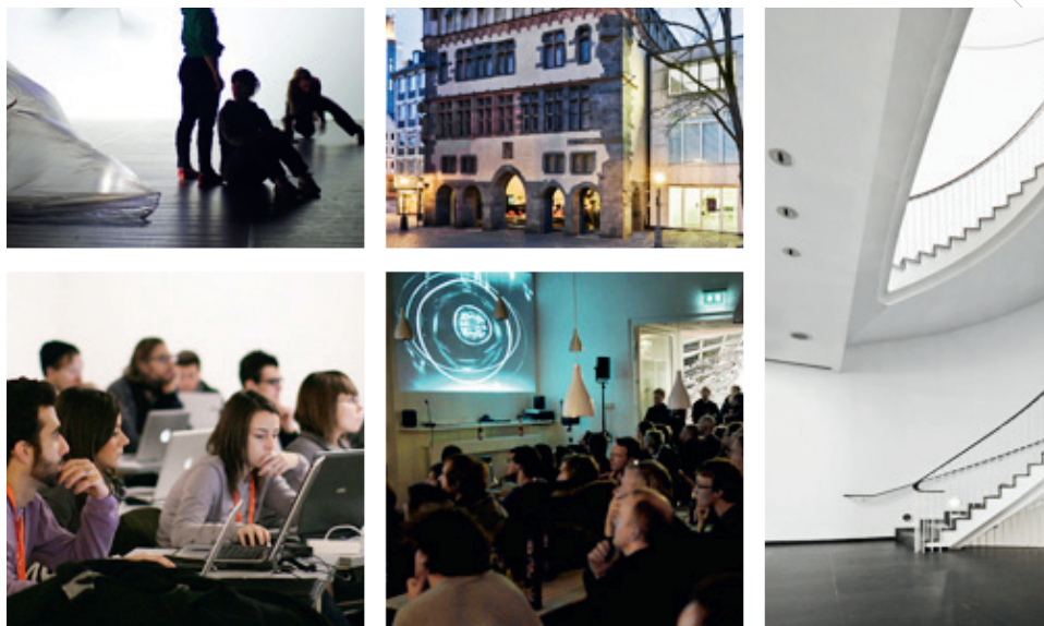
This was NODE10: Performances, workshops and talks at Frankfurter Kunstverein, Germany.